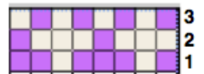
Trim Chart 3